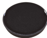
Front (Carbon Pre-Filter)

NOTE: The Activated Carbon Pre-Filter and True HEPA filter are not washable. DO NOT wet either side of the filter when cleaning.